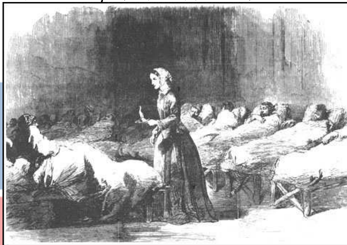
Nursing the sick and wounded